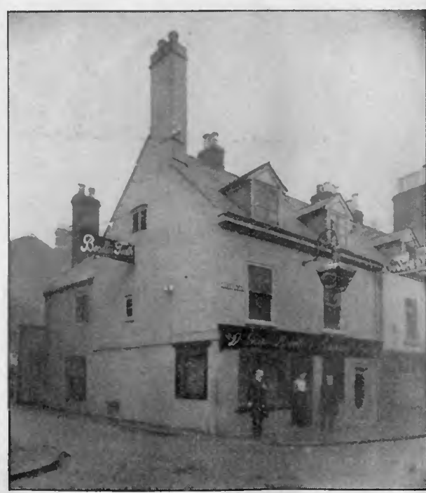
HEAD OFFICE, GLOUCESTER. (Originally the sole establishment.)