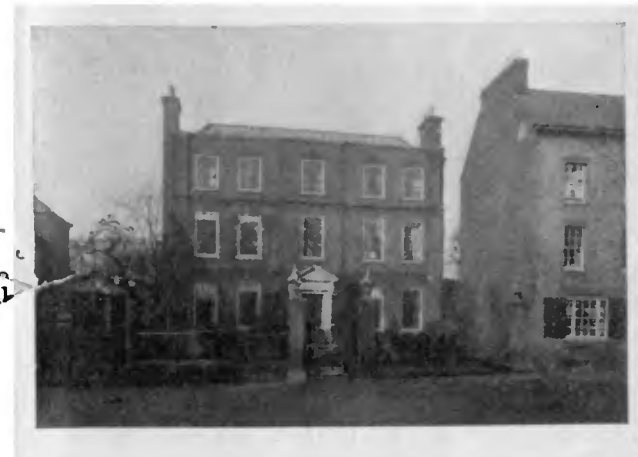
No. 1, Palace Yard.

It need scarcely be added that the Company have adopted the latest methods and appliances for avoiding the pain and discomfort so often dreaded by persons who have no acquaintance with the present day scientific methods.