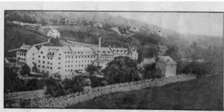
DUNKIRK MILLS, NAILSWORTH. (W. Walker & Sons, Ltd).

The mechanical equipment throughout may be sufficiently described by saying that it is in keeping with the splendid buildings in which it is installed. The machines in use are similar